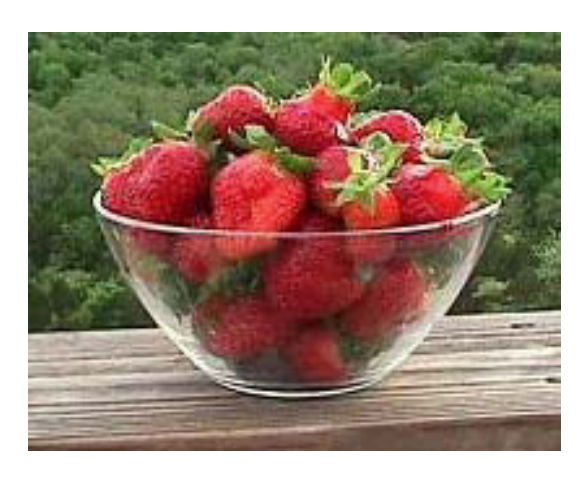
In November the strawberry hangs on a thread of sleep In May it lies in my hand like an erotic dream